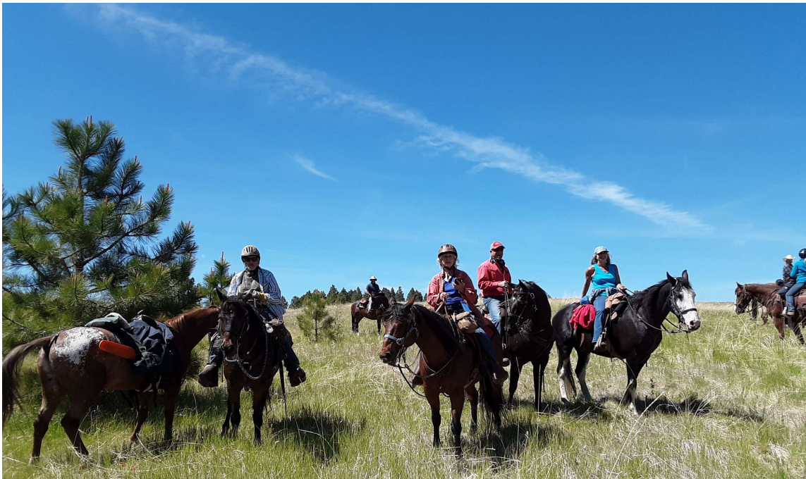
Folks on horseback during the Asotin Ride.